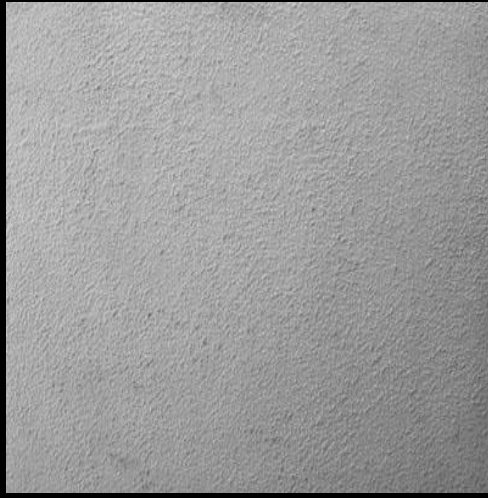
Light Sand Finish #403