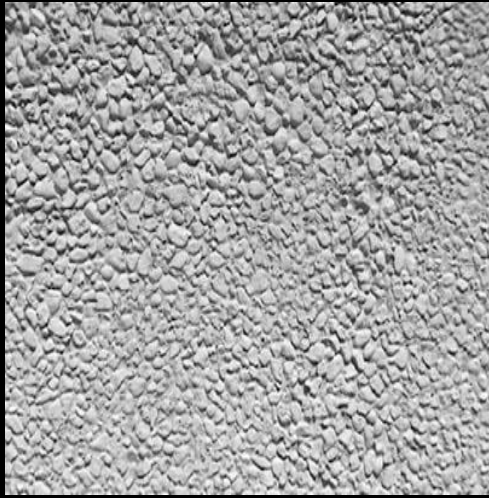
Exposed Aggregate #401