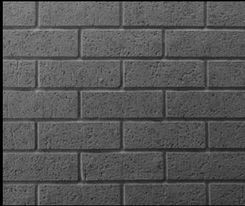
Modular Brick Velour (Concave) #101A