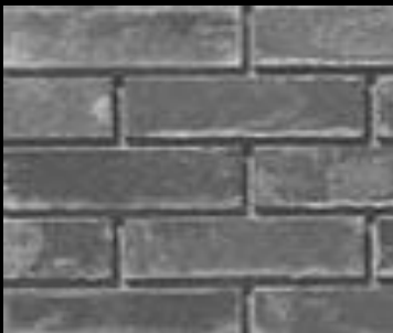
Standard Brick With Textured Joint #107