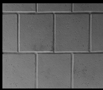
8 x 8 1/2" Running Bond Tile (Concave) #110