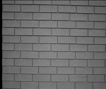
1/3 Running Bond (Concave) #103A