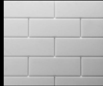
Smooth Utility Brick (Raked) #105B